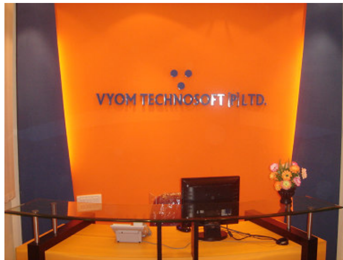
FIG: VYOM BANGALORE DEVELOPMENT CENTER