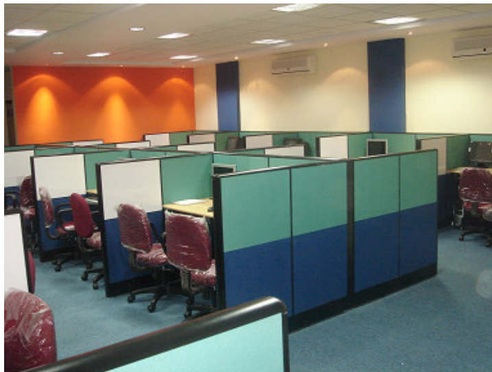
FIG: VYOM DEVELOPMENT AND SUPPORT CENTER